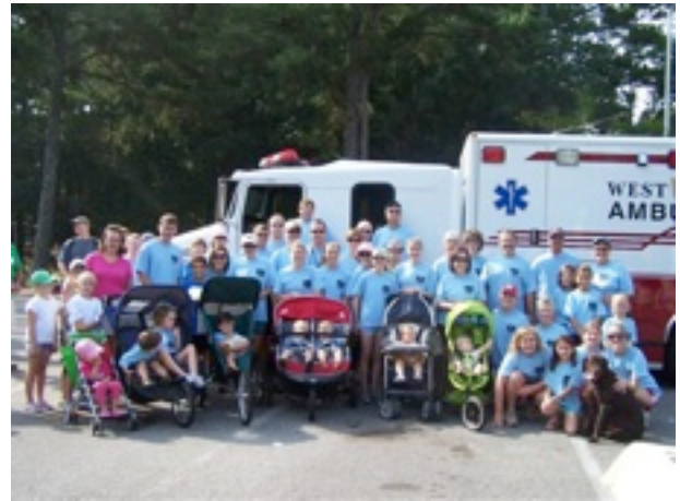
ST. MARGARET'S TEAM RAMSEY 2009