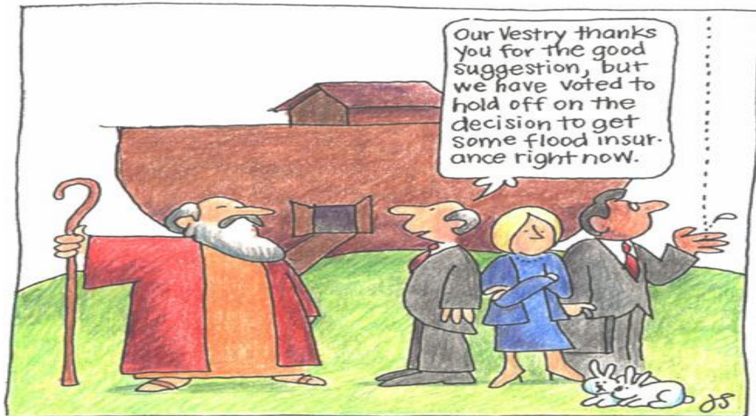
Copyright © 2002 The Church Pension Fund. All Rights Reserved.