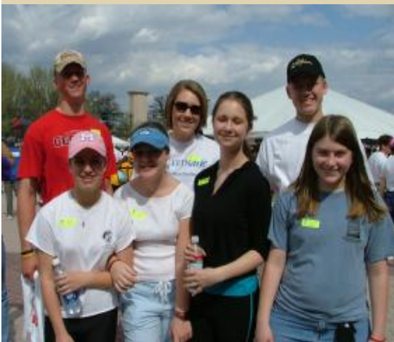
St Margaret's Youth participating in Hunger Walk / Run 2006

It's not too early to start raising money