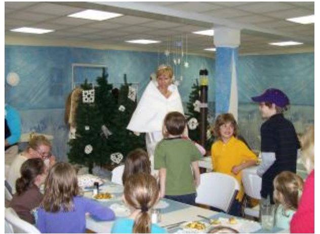
The White Witch stops by for a visit!