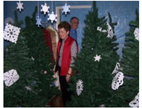
Through the wardrobe door.

ASLAN IS ON THE MOVE! Come be transported to Narnia each Wednesday in March at our Annual Lenten Dinner Series. The program runs from 6 –7 pm and includes a light supper, movie clips and discussion groups for children and adults.