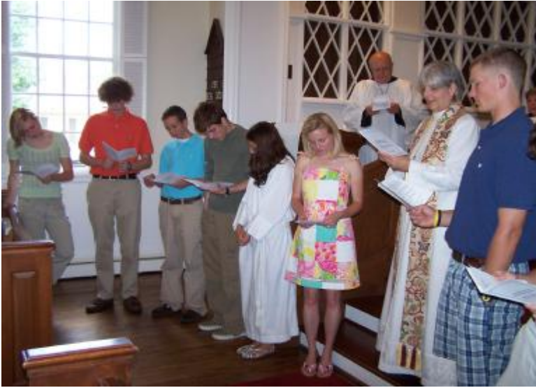
BLESSING BEFORE THEY GO