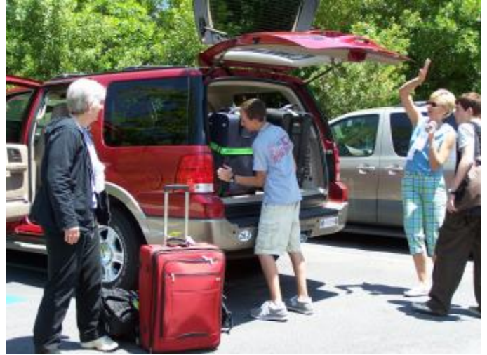
MAKING THE LUGGAGE FIT