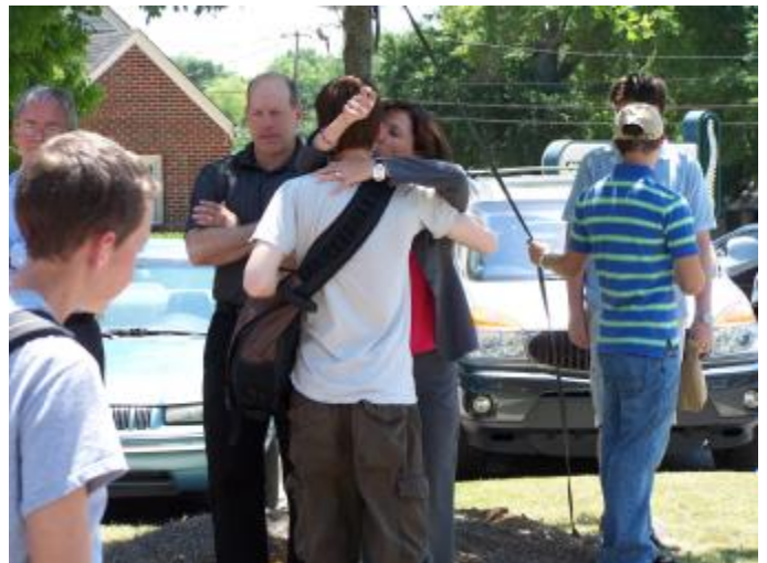
ONE MORE GOOD BYE