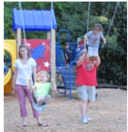
YOUR Senior Warden