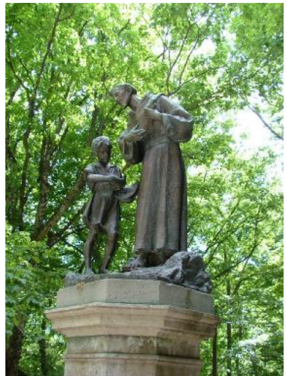
Pictured is a statue of St. Francis at the entrance of the Franciscan Monastery at La Verna, Italy.

Our J2A pilgrims will take an active role in the offerings, and will also be collecting clean used towels to be donated to local animal shelters for use as bedding for dogs and cats awaiting adoption.